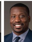
John Scott Jr. Defensive Line Field