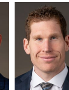
Phil Trautwein Offensive Line Field